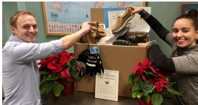
Aqua Leisure staff with the collection drive box - full of donations!

Our friends at Aqua Leisure Industries are hosting a winter clothing drive on behalf of Circle of Hope. Seasonal clothing is so important to the people we serve and we are very grateful for the efforts of everyone at Aqua Leisure.