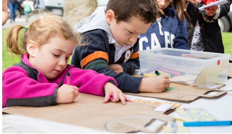
Children decorating donation bags at Full Circle.

Thank you so much to those who brought adult boots in response to our urgent request! We can use more warm boots throughout the winter, so if you have them, please keep them coming!