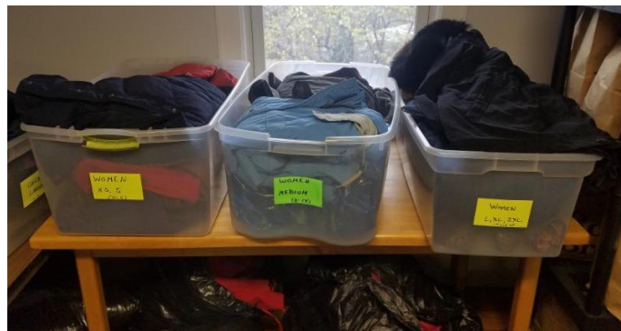
Circle of Hope's "coat corner."