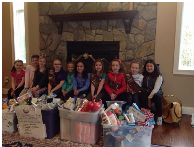
Westwood Girl Scout Troop 86062 with the bins of toiletries they collected.

In January, you may have read about a toiletry drive organized by the Girl Scouts of Westwood. After collecting items late last year, the group wrapped up their collection drive and donated several big bins of toiletries to Circle of Hope last month! The third grade Girl Scout Troop 86062 enlisted all of the Westwood Girl Scouts to collect toiletries at their schools and local events, and the results are fantastic! These important items have already been packed into Dignity Bags and delivered to the shelters we serve. We are so impressed with this group and grateful for their generosity and hard work!