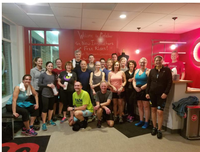
Cyclers posing for a picture after the Ride for Hope charity spin class at CycleBar.