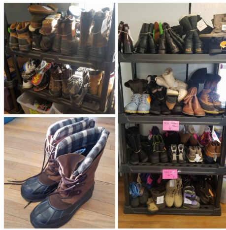
Full racks of boots at Circle of Hope thanks to Dedham Savings employees

In January, you may have read about a toiletry drive organized by the Girl Scouts of Westwood. After collecting items late last year, the group wrapped up their collection drive and donated several big bins of toiletries to Circle of Hope last month! The third grade Girl Scout Troop 86062 enlisted all of the Westwood Girl Scouts to collect toiletries at their schools and local events, and the results are fantastic! These important items have already been packed into Dignity Bags and delivered to the shelters we serve. We are so impressed with this group and grateful for their generosity and hard work!